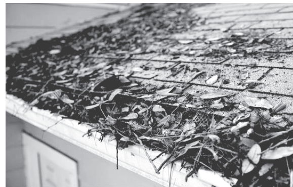
Photo of clogged gutters.

Fall is a great time to clean out your gutters. Leaves can build up in your gutters and decay causing them to be ineffective. This can cause water to fall improperly along your homes foundation which can be very damaging to your home over time. Plus, decaying leaves can add excess harmful nutrients to stormwater which can ultimately affect our water ways.